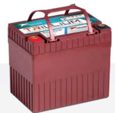
TR 25.6-25 LI-ION

Microprocessor Cell Balancing SOC Gauge Battery Management System