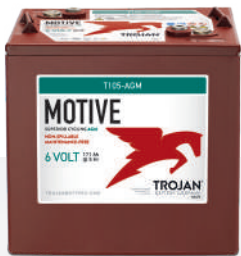
MOTIVE 6-VOLT AGM