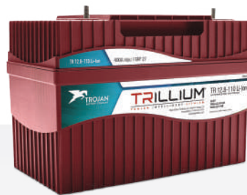
TR 12.8-110 LI-ION

Microprocessor Cell Balancing CAN Communications Battery Management System SOC Gauge