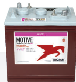
MOTIVE 6-VOLT GEL