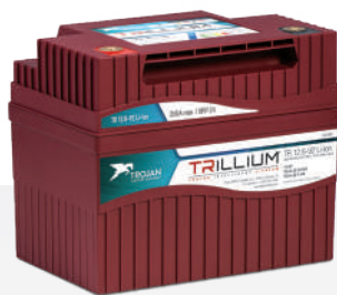
TR 12.8-92 LI-ION

Trillium gives you more runtime and longer life than other batteries in its class and delivers consistent power across the state of charge range. It's 20% smaller than competitors' batteries, can be charged in less than two hours, and is scalable up to 48 volts.