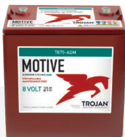
MOTIVE 8-VOLT AGM