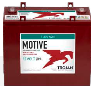
MOTIVE 12-VOLT AGM